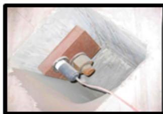
Fixed Position Vibration Sensor

An optional mill shell based sensor can also be added if the acoustic coupling of vibration on a particular bearing housing has been found to be inconsistent. This usually only arises when a bearing oil has great fluctuations in temperature or pressure. In this case it is actually best to fix the bearing issue first and then use the bearing housing mounted sensor.